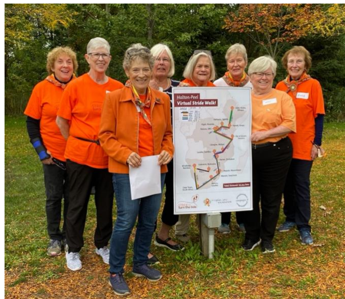
Oomama's Creative Fundraising Committee